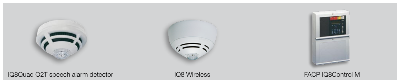
IQ8Quad O 2 T speech alarm detector